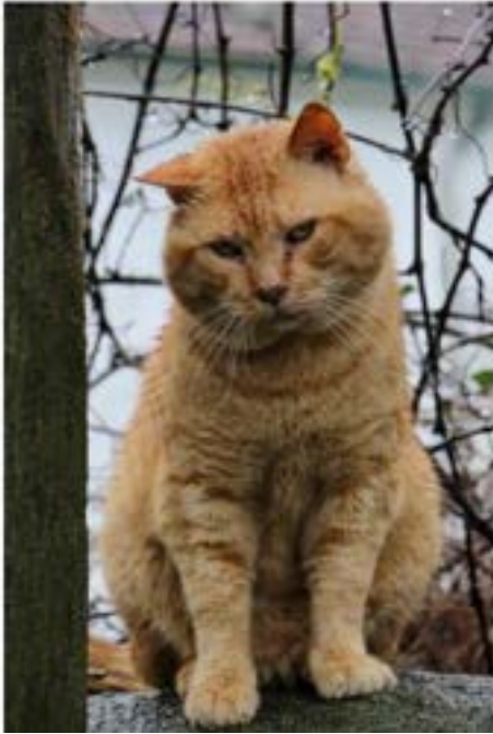
This tomcat will feel a lot better after his visit to the vet's.

In Portugal, TNR projects are increasingly recognised as the most effective way to control the stray cat population. Causas de Caudas' TNR project has established cooperation agreements with several municipalities, namely Gondomar, Porto and Matosinhos; enabling them to offer stray feral cat sterilisation services to colony caretakers for free. However, this has also led to an increase in the number of captures, thus requiring more equipment.