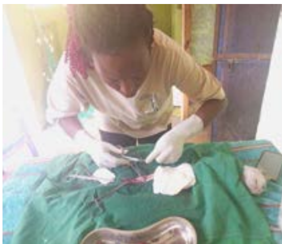
'The cats are patiently baited with fresh fish into specialized trapping cages then taken to our vet clinic for neutering, vaccination and given a meal before being released at the location they were caught from.'