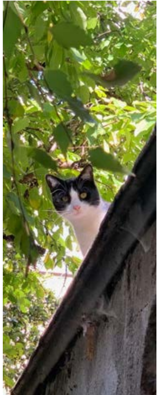
We were happy to see healthy, happy, ear-tipped (=spayed/neutered) cats in the city centre of beautiful Sofia (see the two pictures on the left). There is still a big job to be done however, and the young cat on the right and his whole family were reported to one of the Bulgarian animal welfare groups situated nearby so that they are aware of them.