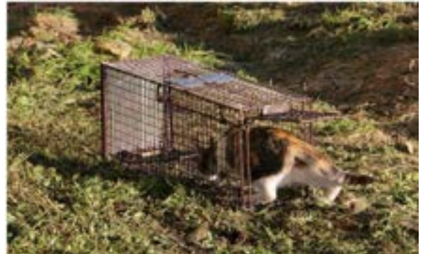
A female cat entering an automatic cat trap.

The donation of trapping equipment has helped the association to increase their work with feral and injured cats, and their report demonstrates how TNR activities were developed after SNIPi's donation.