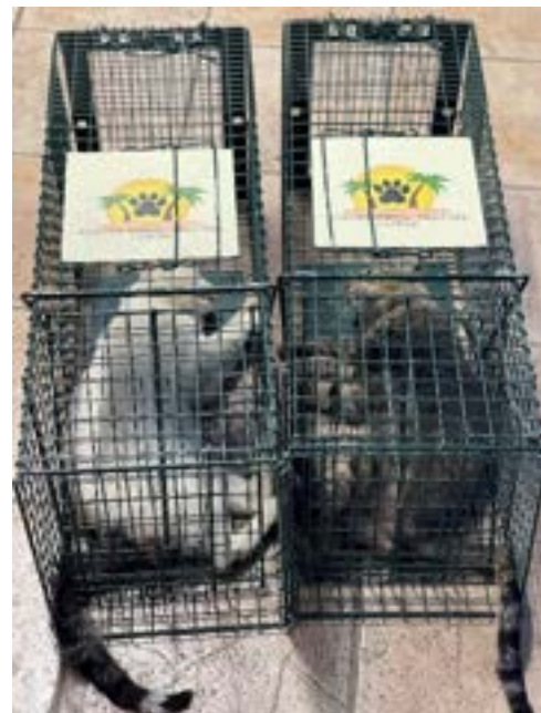
Left: An anaesthetic injection being administered in a squeeze cage. Right: Two cats placed back in the traps whilst they recover from their anaesthetic.