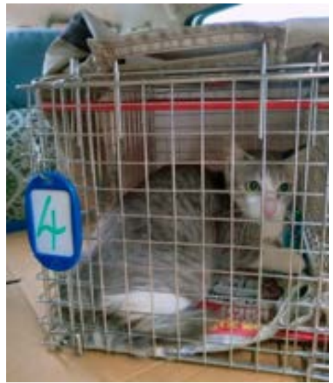
The Catstar Cat Taxi financed by SNIP International and one of the lucky passengers, on his way to the clinic to be neutered.

The third quarter of the year was marked by the ongoing dire economic crisis: daily power cuts, fuel shortages (public queuing outside petrol stations for days), food and cooking gas shortages causing inflation to rise and disrupting day-to-day activities of the local community. Transportation such as tuk-tuks and buses, as well as personal vehicles, were unable to run due to fuel shortages. Sadly, all this resulted in fewer cats being sterilised.