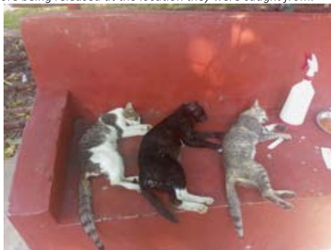
Cats recovering from the anaesthetic.