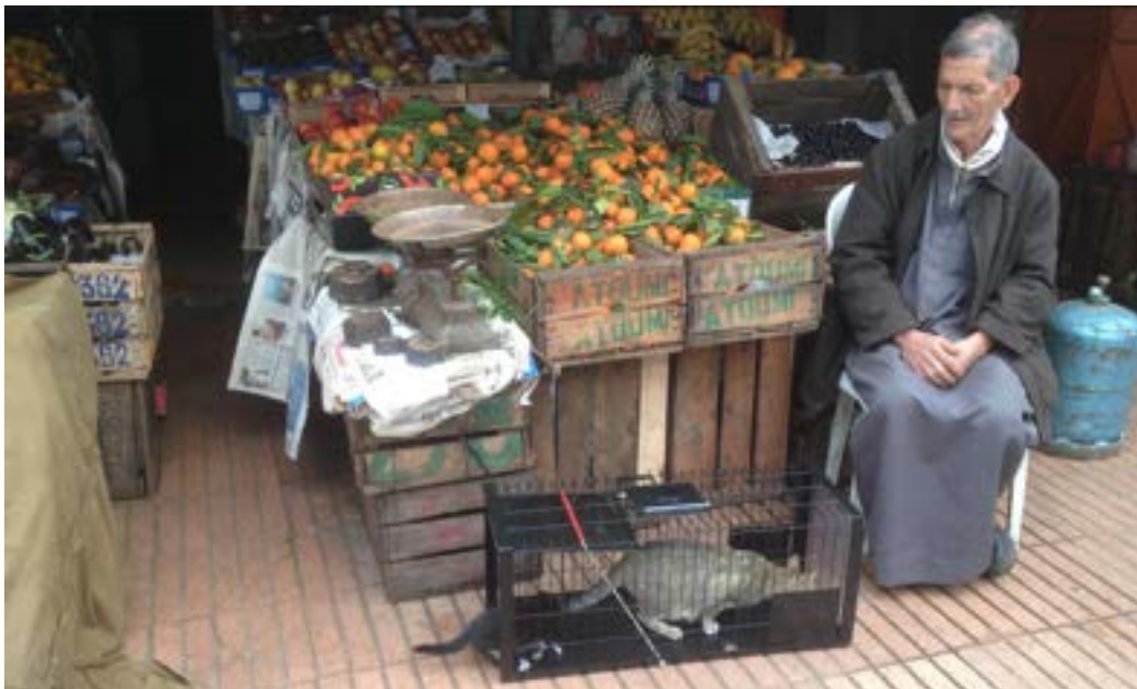
The presence of the cats' regular feeder reassures them and thus facilitates considerably the trapping.

All this with the help of a small equipment donation from SNIP International in 2013 – what a great example of how much can be done with so little equipment! However, after all these years, the TNR equipment is deteriorating, so they have asked for replacement items to continue with their invaluable animal welfare work.