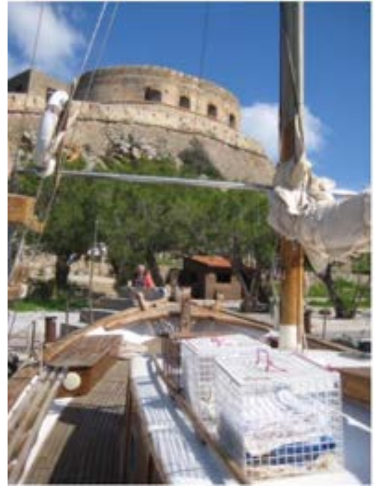
The equipment arriving in Plaka by boat.

SNIPi are very proud of all that PlakaKats has achieved in almost two decades of dedication to cats.