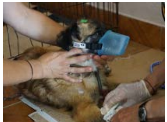
A dog wearing a safety muzzle while being examined and treated by the veterinarian. 13

Associação Bons Amigos aims to neuter a further 2,000 animals (including owned animals) in 2023 by organising further neutering campaigns in Brava, Fogo and São Nicolau Islands! SNIPi appreciates their great work and hopes our support will facilitate further efforts to improve animal welfare and reduce human-dog/cat conflicts in Cape Verde.