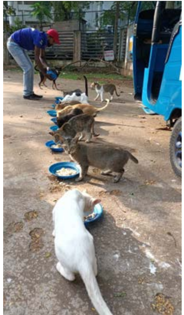
Top left and right: Dogstar feeds cats and dogs, often cats first.

SNIP International is very proud to be part of this ambitious project!