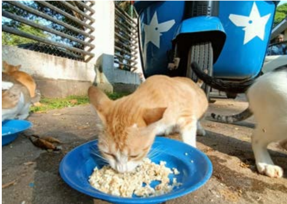
The cats of Negombo enjoy full meals delivered by the Blue Team of Dogstar Foundation. On the right: an ear-tipped (=sterilised) cat of Catstar.