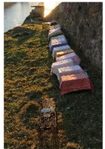
Cats waiting to be released after having been spayed/neutered.

Insight: A large part of the beautiful pictures on SNIPi's website have come from Causas de Caudas, taken by their talented photographer Luis Moreira.