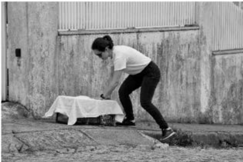
Left: Cats are covered with a towel while kept in traps or transportation baskets. It calms them down considerably and avoids them hurting themselves. Right: Cats can be sterilised from a very young age with the specific methods recommended for early neutering.