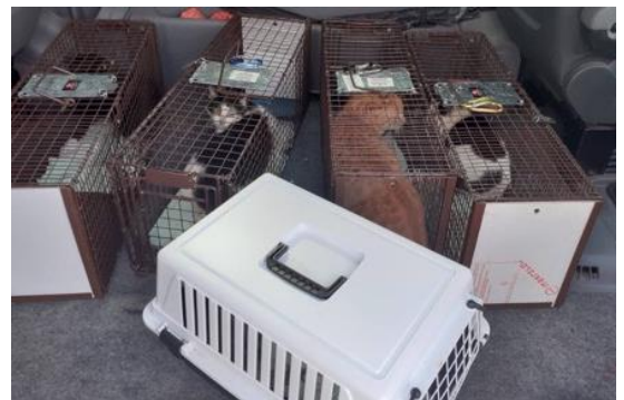
Cats on their way to the veterinary clinic.

SNIPi's generous equipment grant last autumn gave a huge boost to the trapping program. Prior to this, there was only one humane trap known to be available in the entire country, and it circulated from community to community. At times it would "disappear" for months - meaning it wasn't passed on - and the rescue community couldn't remember who had it. But then it would resurface and be passed on again. The small amount of TNR work that was done was mainly by tourists employing laundry baskets and boxes!