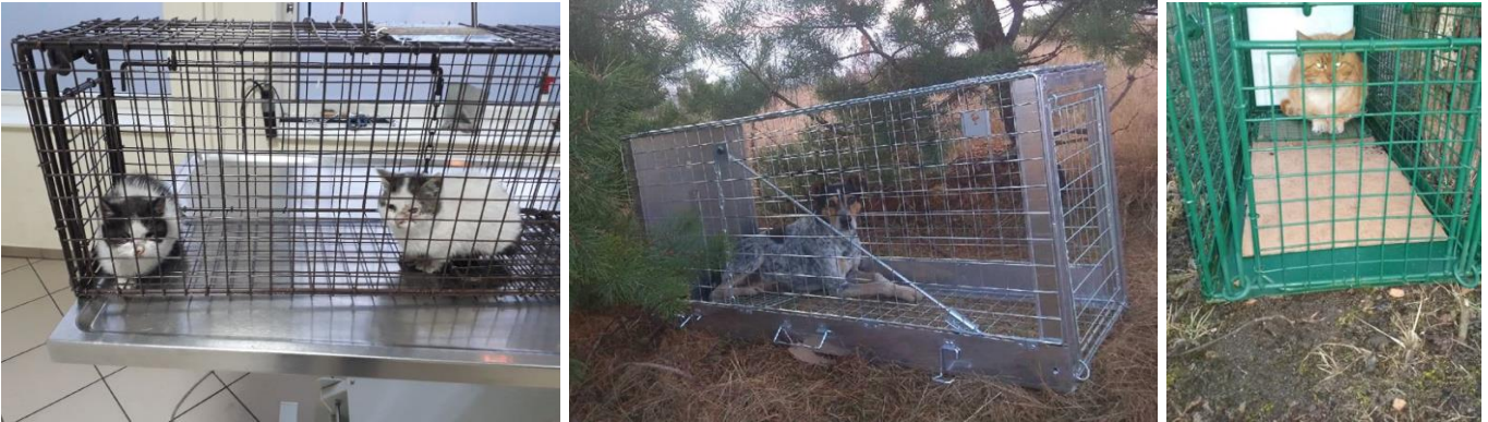
On the left: two sick kittens who were adopted out after their veterinary treatments. In the middle: this 'wrong' dog was caught unintentionally in the dog trap. He enjoyed the sausage meal and waited patiently to be let out! On the right: a tomcat was trapped and released after he had been neutered.

Enjoy this selection of pictures demonstrating their hard work!