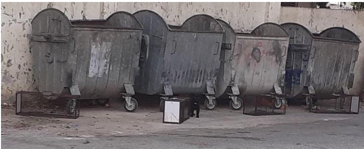
Traps in Kotor waiting for cats to enter with one showing interest.

What do you do if you visit an area famous for its street cats but discover there's no spay-neuter program you can donate to? You start one of course! That is how Kotor Kitties began as the first on-going program offering free neutering in Montenegro. It was 2018 when some American tourists and their Airbnb hosts agreed to raise money to fund 10 spay surgeries through the local family vet in Kotor Municipality; they had no idea that there were no other neutering programs in the entire country.