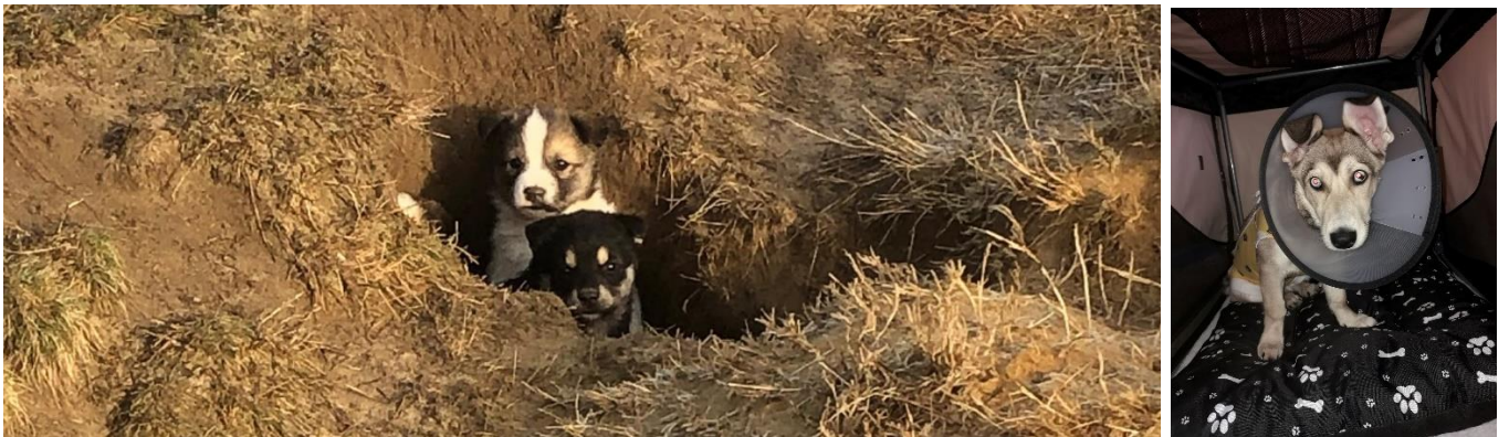
On the left: the two last puppies of the five (see above). On the right: one of the stray dogs caught in Bęczków. He was adopted after neutering.