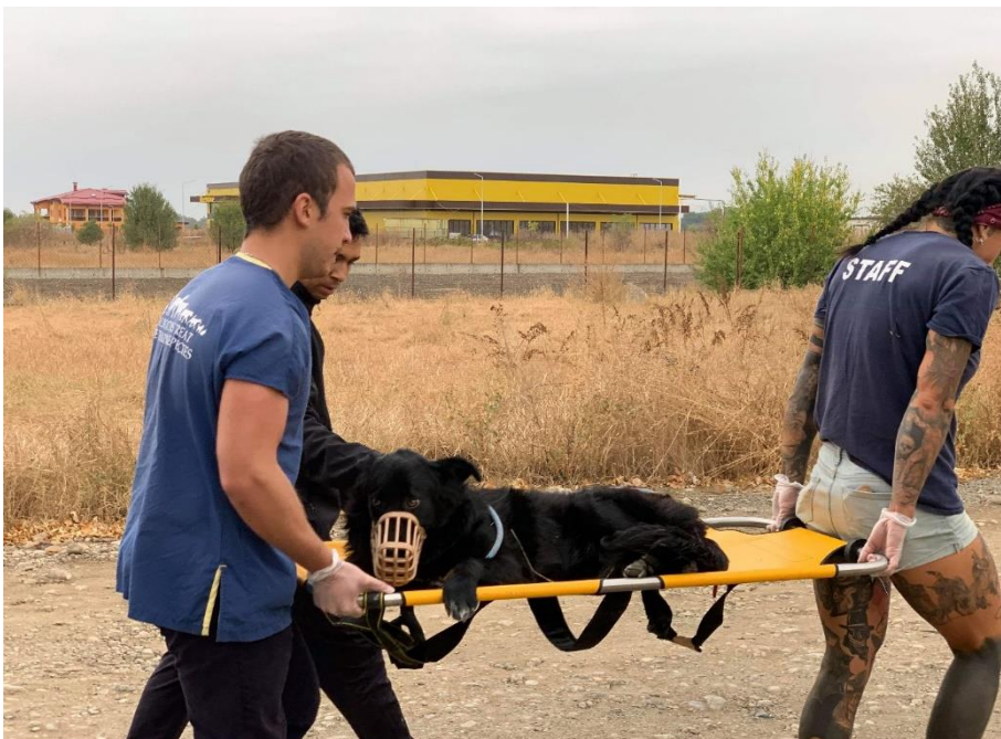
Injured Ogniana being transported safely on the animal stretcher donated to Animal Rescue Sofia at ICAWC through SNIP International.

They took the dog in immediately and she was given emergency treatment to save her life.