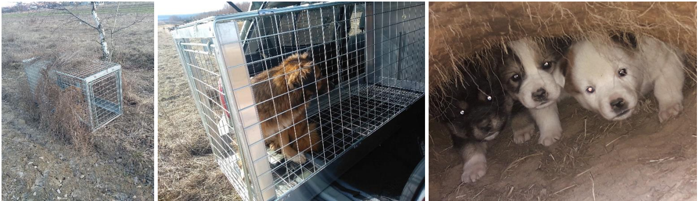
From L to R: a mama dog living with her five puppies on a field in Bęczków was caught in a dog trap and her puppies were recovered from the den (on the right and below). The mama dog was spayed and all of them were eventually adopted.