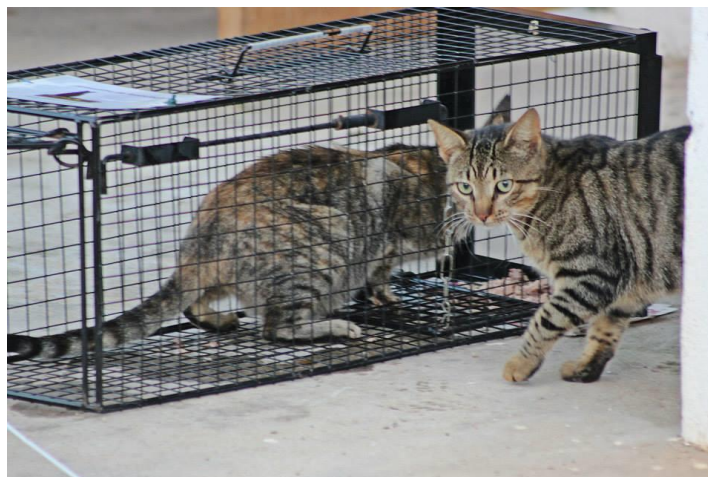
Cats being captured with a cat trap donated by SNIP International.

In October 2014 we ran a two-week TNR campaign to vaccinate, sterilise and treat as many cats as possible. In that time we reached 161 cats - an estimated 74% of the cat population. We also worked with a local university to collect things like skin and faecal samples to test for the presence of parasites, blood samples to test for zoonotic disease, and reproductive organ samples to test for tumours and other hormone related conditions.