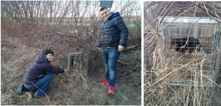
Udruga Pobjede dog trapping. We particularly liked the use of shrubbery to disguise the trap!

The group Udruga Pobjede is based in Osijek in the north east of Croatia. They run a no-kill shelter, opened in 2010. They have 50 volunteers who mostly work with stray dogs which are not allowed on the streets by law. In the past year they caught 260 dogs, neutered 300 and rehomed 360. They do some cat work also, having trapped 30 cats in the last year of which 20 were homed and 10 were returned to site. Project Croatia allocated the group the following equipment: Vulcan dog/fox trap, rabies gloves, soft e collar, Baskerville ultra muzzle. A message from Maša Riznić: