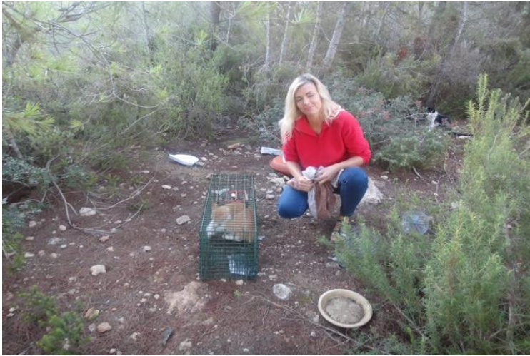
Cat trapping in the woods of Ibiza