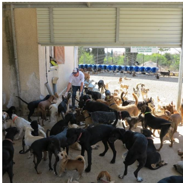
The dogs are divided into several groups by their size, age and temperament. The day was very warm, so the dogs were mostly resting in the shade. They can also shelter in the barrels shown in the background. The dogs are regularly exercised and trained in a separate large paddock and get a lot of love and attention.