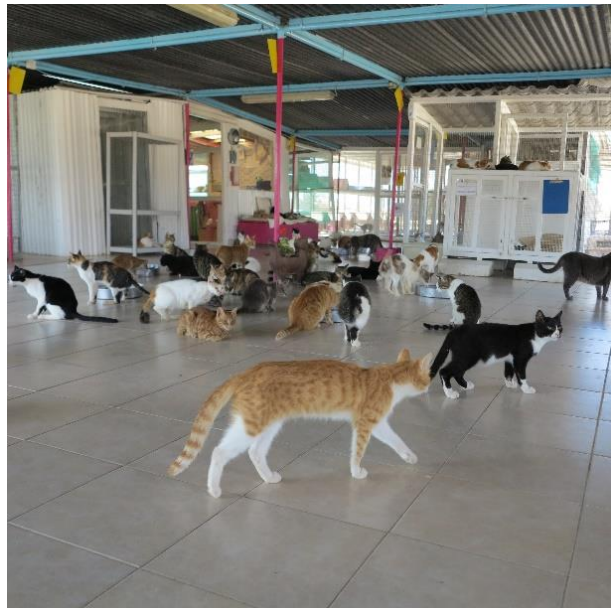
Most of the cats roam freely outside, with access to food and shelter in the "cat house". All the cats are neutered and ear-tipped and very friendly!